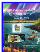
KONA ICE Today right after service

Welcome Visitors and Guests! Please fill out the Welcome Card at the seat pocket in front of you and bring it to the Welcome Center at the church lobby! We have a welcome gift waiting for you. Or, just fill it up online using this QR code and ask for your welcome gift. Just mention that you filled up the Welcome Card online.