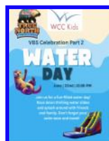
GIANT WATER SLIDE DAY Sunday, July 22nd after service