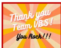
THANK YOU TEAM VBS! GOD BLESS YOU RICHLIY