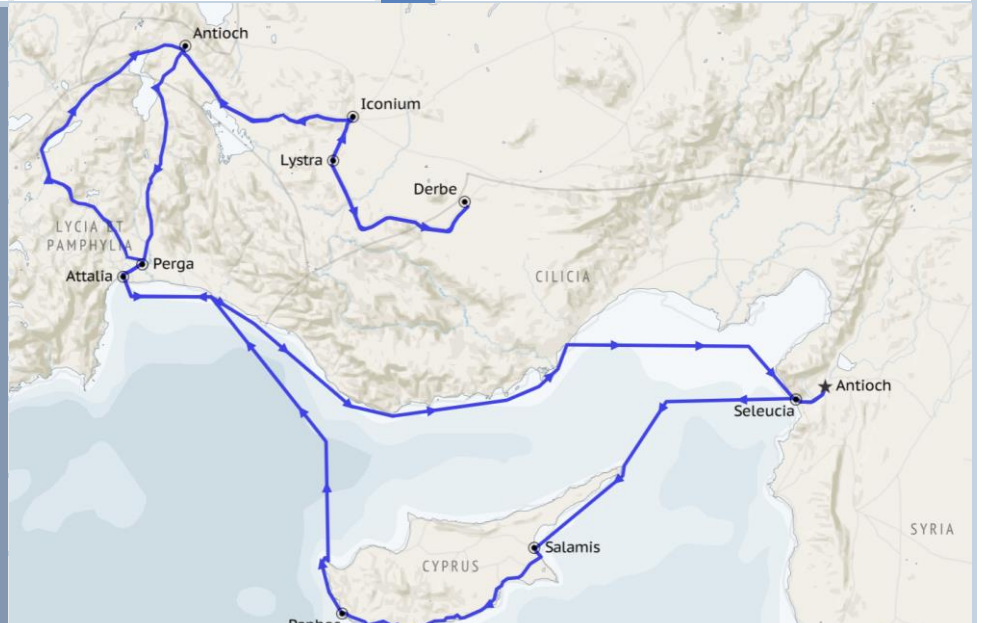
First Missionary Journey