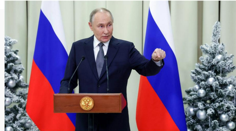
Russian President Putin Speaking at a Press Conference

As the world became more dangerous in 2024, the use of its most dangerous weapons has become more likely.